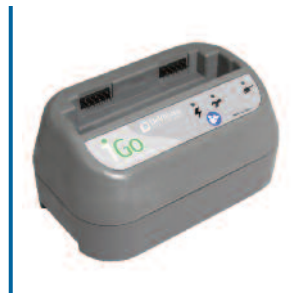
Battery Charger (306CH)