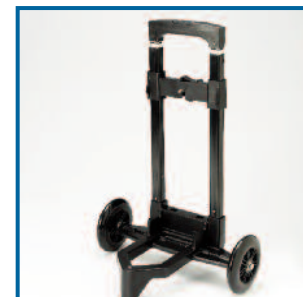
Detachable Wheeled Cart (306DS-626)