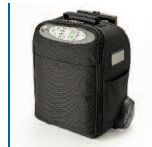
Deluxe Rolling Carry Case (306DS-635)