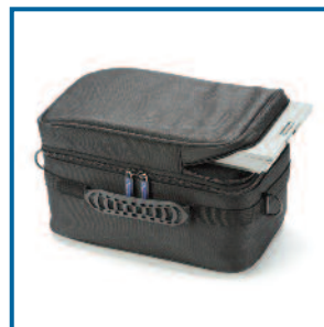
Accessory Bag (306DS-655)